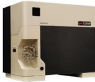
Benchtop Mass Spectrometer for Real-Time, Multi-Stream, Solvent Drying and Endpoint Determination MAX300-LG™