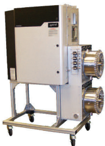
Real-Time Air Mass Spectrometer for Environmental Health and Safety MAX300-AIR™