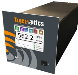
CRDS Trace Gas Analyzer for ppb-Level of H 2 O, CH 4 , CO, CO 2 , and C 2 H 2 Detection Spark™