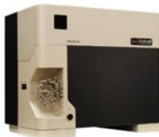
Benchtop Mass Spectrometer for Real-Time Multi-Stream, Bioreactor Control MAX300-LG™