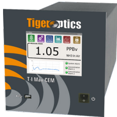
CRDS Ambient Pressure Analyzer for Trace HCl, NH 3 , HF, H 2 S, and CH 4 T-I Max™