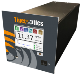
CRDS Trace-Level Low-Pressure Moisture Analyzer HALO RP™/QRP™