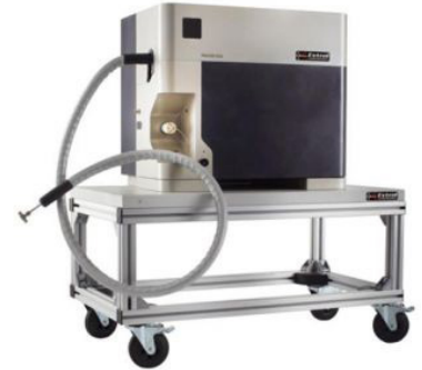
Benchtop Mass Spectrometer with Heated, Evolved-Gas Inlet for Real-Time, Continuous Off-Gas Analysis MAX300-EGA™