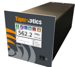
CRDS Single-Species, Trace Gas Analyzer for ppb-Level H 2 O, CH 4 , CO, CO 2 , Detection Spark™