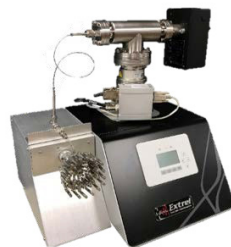
Benchtop Mass Spectrometer for Real-Time ppb-Level to 100% Catalysis, Reaction Monitoring, and Environmental Research MAX300-CAT™