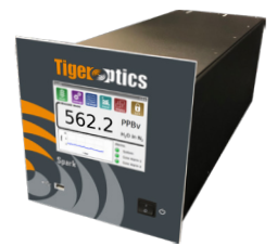
CRDS Trace Gas Analyzer for ppb-Level Detection of H 2 O, CH 4 , CO, CO 2 , and C 2 H 2 Spark™