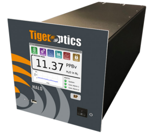
CRDS Trace-Level, Low-Pressure Moisture Analyzer for Lyophilization HALO RP™/QRP™