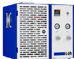
COD Water Analyzer for Laboratories QuickCODlab™