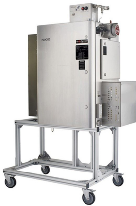
Industrial Mass Spectrometer for Real-Time, Multi-Stream, Solvent Drying and Endpoint Determination MAX300-BIO™