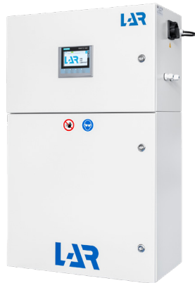
TOC Water Analyzer for Clean Water Applications QuickTOCuvII™