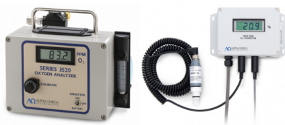
Trace to Percent Oxygen Monitors for Portable and Fixed Applications Series 3520™ | OXY-SEN™