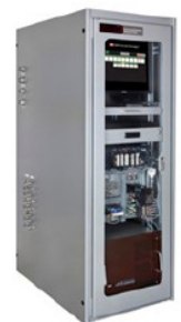
FTIR Environmental Vapor Monitoring Analyzer ANALECT EVM™