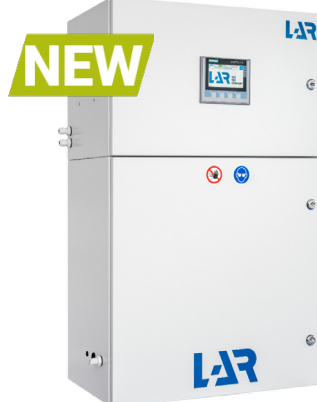
TOC Water Analyzer for Municipal & Cooling Water Applications QuickTOCeco™