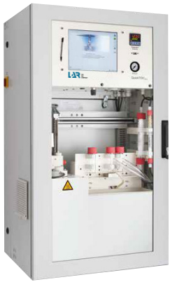
TOC Water Analyzer for Harsh Wastewater Applications QuickTOCultra™