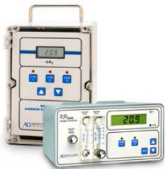
Percent and Trace Oxygen Analyzers and Oxygen Deficiency Safety Monitors Series 2000™ and ZRO2000™