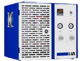
COD Water Analyzer for Laboratories QuickCODlab™