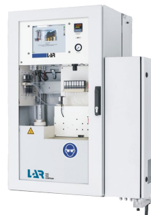
TOC Water Analyzers for Pure and Process Water Applications for Laboratories QuickTOCpurity™