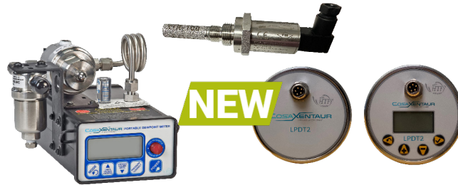
Aluminum Oxide Dew Point Meters for Portable/Fixed/Loop-Powered Applications XPDM™ | HDT™ | LPDT2™