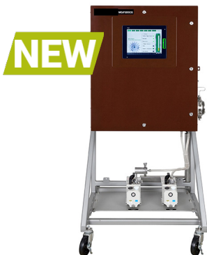
Real-Time, Multi-Stream Mass Spectrometer Gas Analyzer for Accurate OUR, CER and RQ MGA 1200CS™