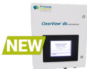
Dual Beam Photometer for Real-Time Hydrogen Peroxide Vapor Sterilant Gas Monitoring ClearView® db Hydrogen Peroxide Vapor Analyzer