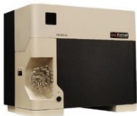
Laboratory Mass Spectrometers for Real-Time, ppb-level, Multi-Impurity Analysis MAX300-LG™