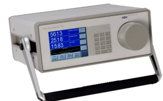
Chilled Mirror Dew Point Hygrometer with Measuring Head for Temperature and RH Measurements MODEL 973™