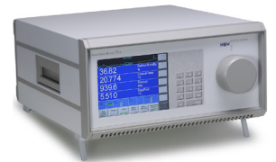
Chilled Mirror Dew Point Meters MODEL 373™